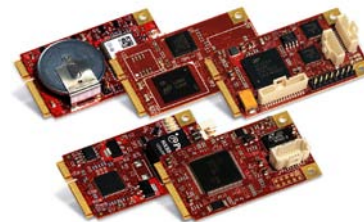
Mini PCIe Modules