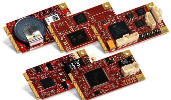
Mini PCIe Modules

Call VersaLogic Sales at (503) 747-2261 for more information!