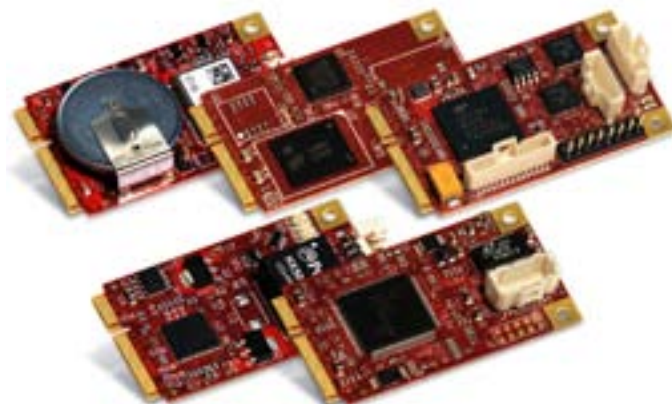
Mini PCIe Modules