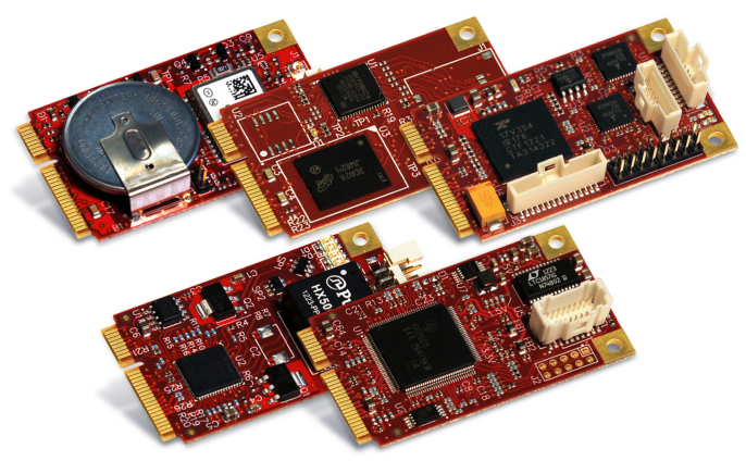
Mini PCle Modules